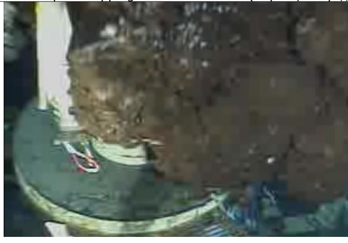
Oil and gas coming out from under the LMRP