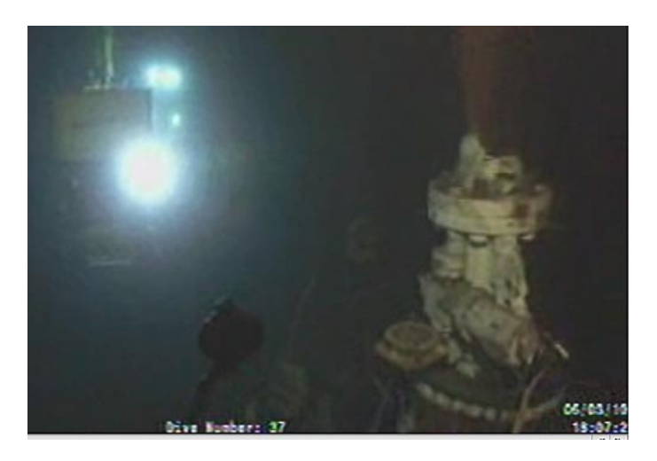
Lower Riser Assembly (LRA) atop the Blowout Preventer (BOP) at the Deepwater Horizon well, with the bent riser removed, waiting for the arrival of the Lower Marine Riser package (LMRP)

The vertical section of the riser was cut, using a Shear, at 9 am Thursday morning.