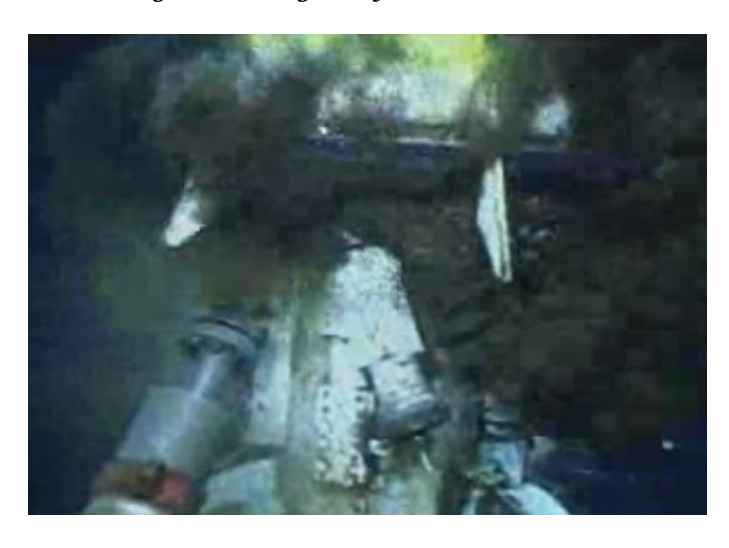
Leaks under the LMRP at 10:30 pm

For those who may not remember, this was the initial plan as it was proposed.