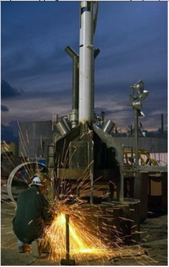
Building LMRP 7 on June 2nd at Port Fourchon (BP)

The Lower Marine Riser Package (LMRP) was first connected to the riser, and to a methanol feed that would help, between them, to inhibit the formation of methane hydrides when the gas came into contact with the surrounding cold seawater. It was then slowly lowered to the site, and across into the fountain of oil and gas, and down over the top of the riser.