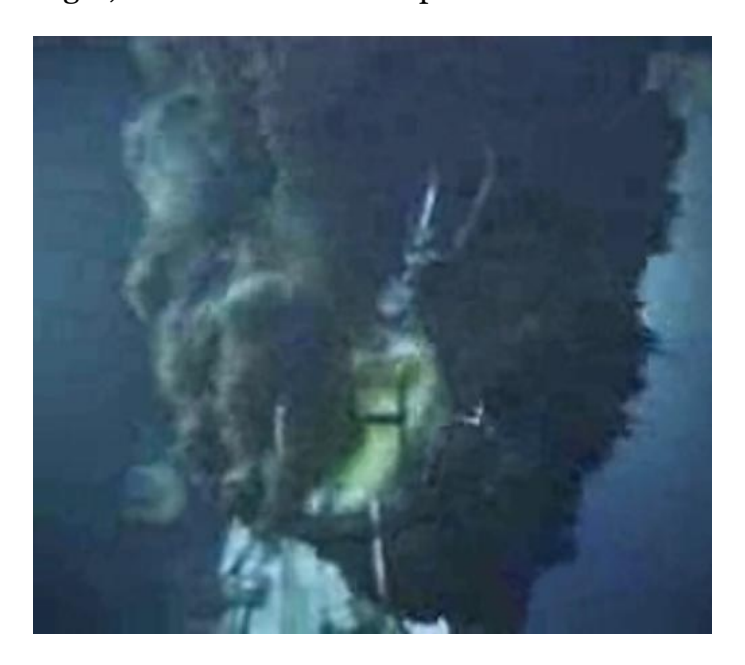
Lowering the LMRP into the cloud of oil from the riser.

The Lower Marine Riser Package (LMRP) was first connected to the riser, and to a methanol feed that would help, between them, to inhibit the formation of methane hydrides when the gas came into contact with the surrounding cold seawater. It was then slowly lowered to the site, and across into the fountain of oil and gas, and down over the top of the riser.